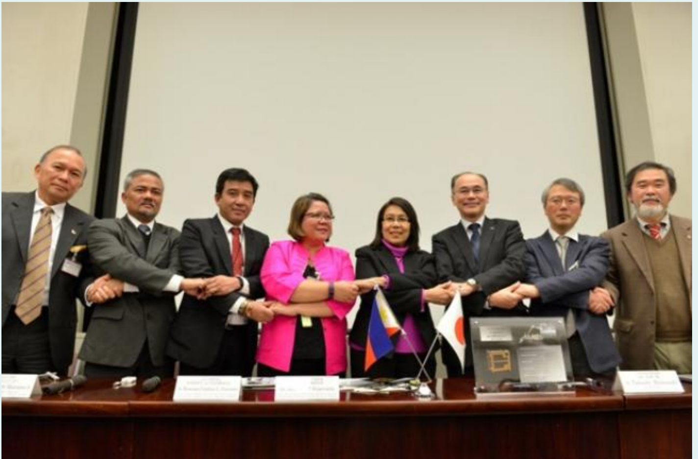
DOST tie-up first step toward realizing Philippines' satellite dream [ READ MORE ]